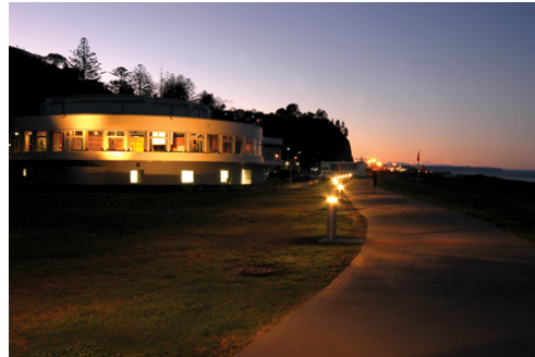
Napier city's waterfront cycleway.